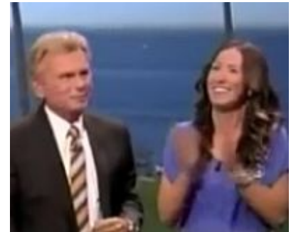
Pat Sajak 'loses it' after 'Wheel of Fortune' fail