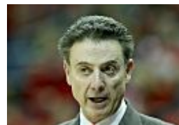
Pitino on blowout: We played four white guys and an Egyptian