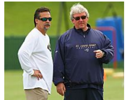
7 Worst NFL Head Coaches Ever