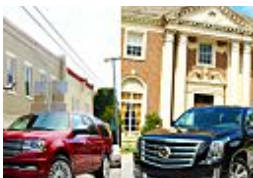
Head to Head: Lincoln Navigator vs. Cadillac Escalade