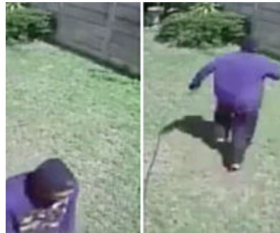
Fierce Guard Dog Runs Off Wannabe Burglar (And You'll Never Guess The Breed)