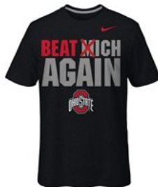
Nike Ohio State Buckeyes Black Rivalry T-Shirt $25.95 Buy Now navigateright