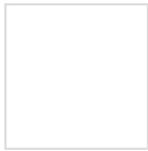
"Hell is so Hot Right Now" UNIF SS11