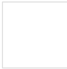
Album Reviews: 11/13/12