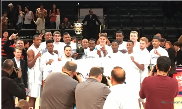
The Longhorns have started off the season right, winning the 2K Classic and improving to 4-0.